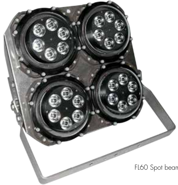
FL60 Spot beam

The FL60 spot beam is made of seawater resistance aluminum and mounted by stainless steel frame and bracket. The combination of these materials provide a solid floodlight with low weight of less than 20 kg for the 4 module version.